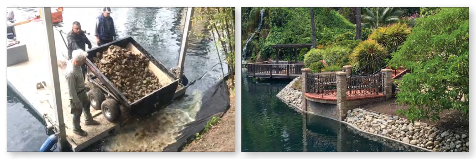
(Above, left) Erosion posed a serious threat to the pathways around the lake. As a remedy, a team of SRF monks, lay members, and staff designed and installed a protective row of steel posts, wire mesh, and stones (literally tons of them!) that runs the length of the entire shoreline. Now the banks are protected for many years to come. (Above, right) A section of reinforced shoreline. Once the last piece of the project has been completed, the lake will be raised to its normal level, and the stones will be hardly visible. Also shown is an elegant new stone and brick landing that was constructed to replace an older structure made of wood.

One finishing touch is still yet to be done: replacement of a small time-worn wood deck near Paramahansaji's Houseboat. This is a popular spot where visitors often stop to meditate and take in the beauty of the lake. Your continued support will make it possible to complete this project in 2021.